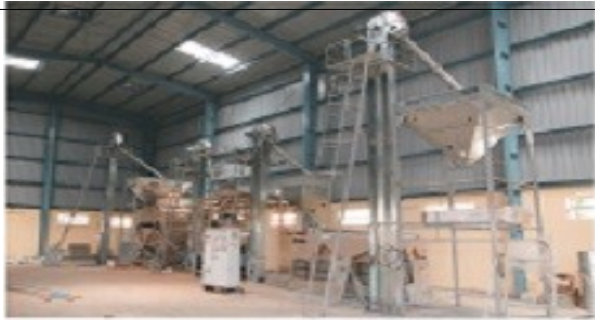
INSIDE VIEW OF PROCESSING UNIT