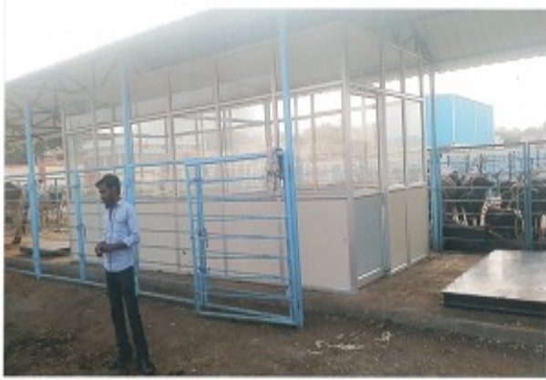
VIEW OF SHEEP AND GOAT WEIGHING PLATFORM