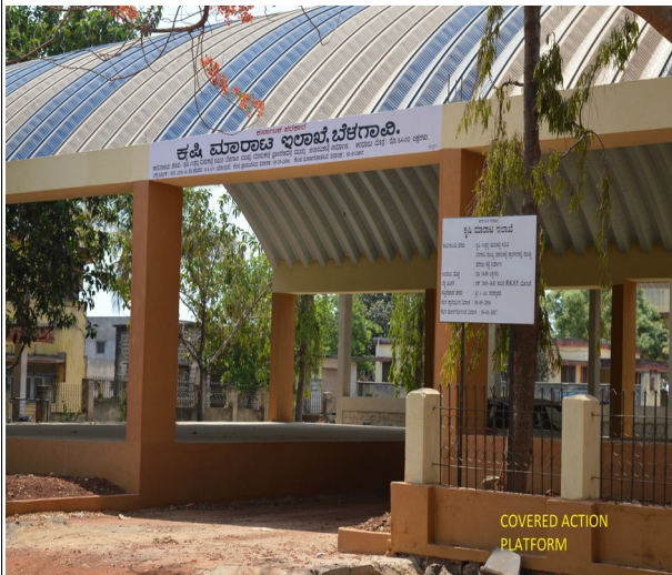
COVERED ACTION PLATFORM