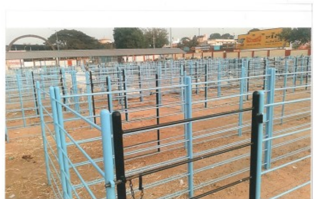
VIEW OF THE SHEEP AND GOAT MARKET FACILITY